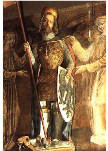
Statue in Prague

A very strong oral tradition supports the claim. Within a few decades of his death people were writing tributes to his generosity. Typically: "no one doubts that, rising every night from his noble bed, with bare feet and only one