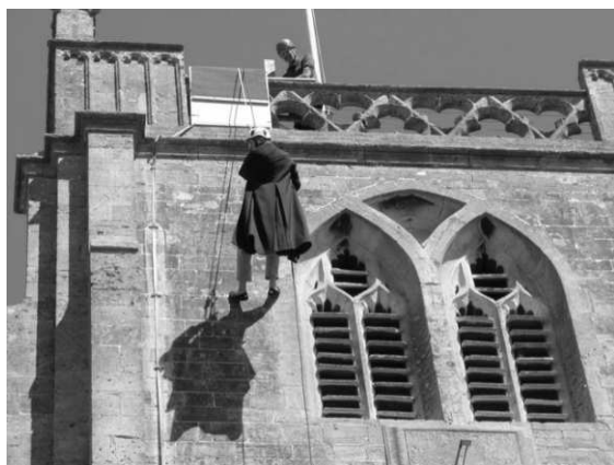
Our former curate, Nigel, abseiling on a previous occasion